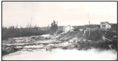
Little Bull Falls, starting point of the last log drive on the Yellow River.

At 4 o'clock in the morning the call came to "come and get it." The men