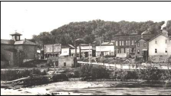
Yellow River and Main Street, Necedah, Wisconsin, circa 1905.

NECEDAH, Wis.-The founding of the village of Necedah is dated at 1853 and history relates that it was a bustling lumber town in the era of the white pine.