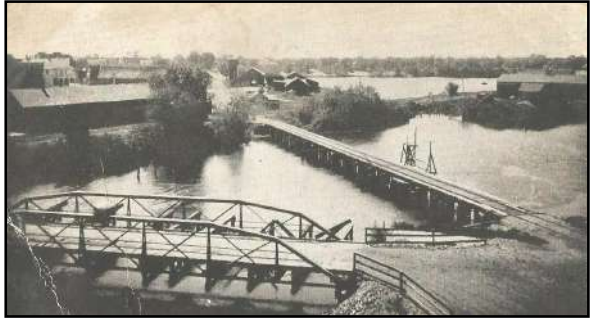
Eastern portion of bridge and railroad trestle, spanning Yellow River, just above the dam, Necedah, circa 1909.

Serious fires hit the business district in 1886 and much of Main Street was destroyed in 1915. The opera house block burned in 1920 and three buildings were destroyed in 1925. (from The La Crosse Tribune , La Crosse, Wisconsin, Sunday, Nov 8, 1964, Page 13)